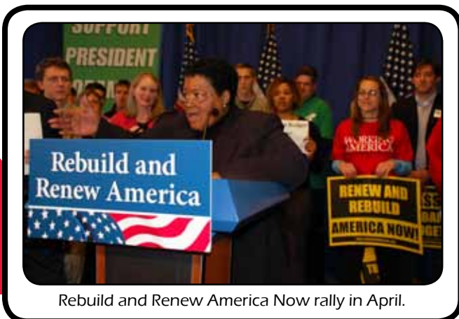
Rebuild and Renew America Now rally in April.

USAction's work on the stimulus and budget resolutions helped reset the nation's priorities to rebuild and renew America for the challenges we face, not only now, but for many years to come.